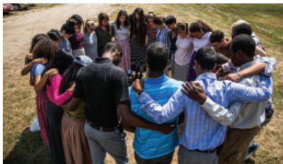
Literature evangelists in prayer before knocking on doors.

Over a decade ago, church administrators across the North American Division were faced with a dilemma regarding the publishing work. While they knew this work was ordained by God and was destined to go to the very end, the publishing work had lost its evangelistic vision. For this reason and other challenges which the work faced, it resulted in the steady demise of the publishing work in support, both financial and otherwise.